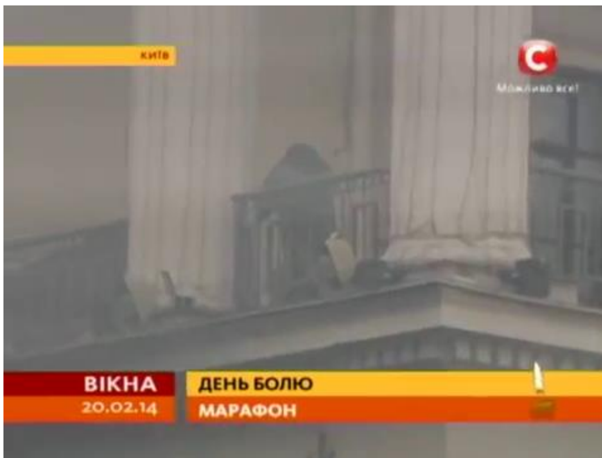
Photo 2. A reported shooter in the Music Conservatory around 8:00am during the mass shooting of the police by Maidan “snipers” from this building. (Source: “Хронологія бойового ранку: хто порушив перемир'я - Вікна-новини - 20.02.2014,” STB , February 20, 2014, https://www.youtube.com/watch?v=fdbae8rZ-qw ).

The Maidan shooter in the BBC and Vesti interviews said that he was among a group of about 20 protesters who were asked at around 6:00pm on February 19 to come forward if they had shooting skills and then given a choice of weapons, which included shotguns and Saiga rifles—which is based on the Kalashnikov assault rifle—before being told to take convenient positions. He saw some 10 other protesters shooting at the police from the conservatory building in the morning of February 20. Maidan eyewitnesses among the protesters said that organized groups from the Lviv and Ivano-Frankivsk regions in Western Ukraine arrived at Maidan and moved to the Music Conservatory several hours after midnight on February 20, and that some of them were armed with rifles. 51 Two hotel rooms of German journalists at Hotel Ukraina were shot at from the direction of the main post office, as a Ukrainian journalist working for the German TV reported on his Facebook page, or from the direction of the conservatory. 52