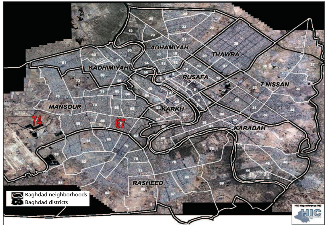
The boundaries and names shown and the designations used on this map do not imply official endorsement or acceptance by the United Nations.

intel that characterized the Cold War. Here, the threat is less homogeneous; its tactics more adaptive; its structures, relationships, and motivations more amorphous. Understanding the threat alone is far from sufficient. Information on public perceptions of the many authorities (the coalition and government of Iraq among them), behaviors and leanings of indigenous security forces within the 2nd BCT/1st Infantry Division AO, and the relationships between JAM (itself consisting of several loosely, if at all, interconnected entities) and security forces, Baghdad politicians, and the Shi'a population is but a drop in the bucket of what Colonel Burton and leaders like him required. Metrics presented a no less difficult challenge. The same measure might reflect completely different statuses over time, e.g., an absence of pleas for assistance from a traditionally Sunni neighborhood might mean that longtime residents did not feel threatened. It could also mean that most Sunnis had been forced to leave; what few remained might be so intimidated that contact with coalition representatives was a life-threatening risk. U.S. doctrine and training—and those of fellow coalition members—were and are only beginning to catch up with events in the field.